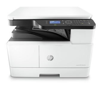
HP LaserJet MFP M42625dn