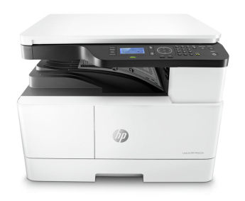
HP LaserJet MFP M42625n

Surpass your office printer expectations with the speed, quality, and efficiency of HP LaserJet office printers.